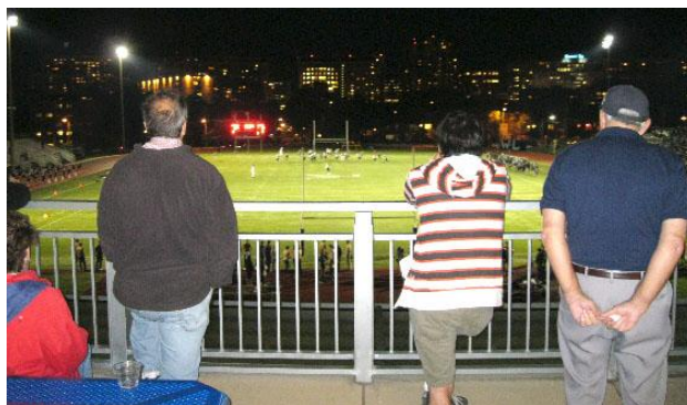
Can't beat the view from the library balcony, except for goal-line stands on the Washington Blvd. end of the field.