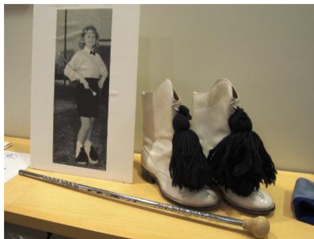
Memorabilia on display focused on fall sports including a W-L football from 1949, sports programs, photographs, majorette and cheerleading uniforms.