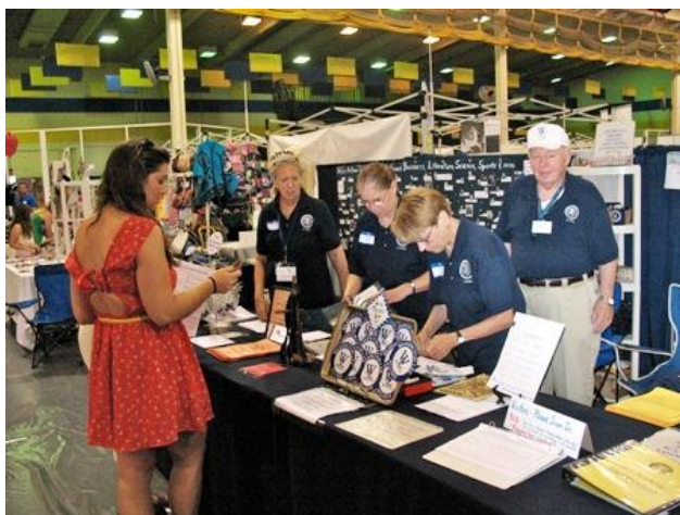
Our smiling alumni welcomed visitors who stopped by our booth.